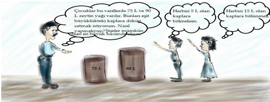
Figure 3. Divisibility and prime number a sample of cartoon