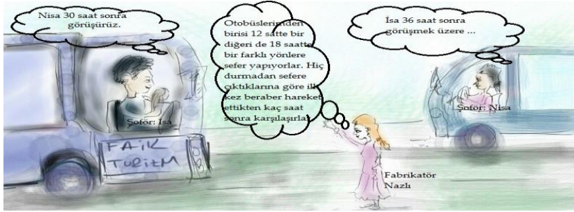
Figure 5. A sample of Cartoon Determined common divisor and common factors of natural number and applied problem