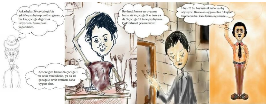
Figure 1. Instruction on the topic of multiplier of a sample of cartoon