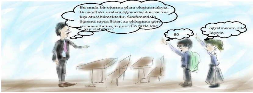
Figure 4. A sample of cartoon toward determined common factor of natural numbers