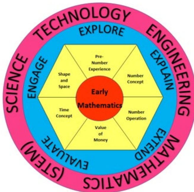
Figure 3. Mathematics curriculum framework for early childhood education (3-4 years old) based on Science, Technology, Engineering and Mathematics (STEM)

As shown in Figure 3 , the mathematics curriculum framework for early childhood education (3-4 years old) based on STEM have six topics, as provided in the early mathematics in KSPK, which are Pre-number Experiences, Number Concepts, Number Operation, Value of Money, Time Concept, and Shape and Space. Following the mathematics curriculum framework, the lesson is conducted using the 5E instructional model which has five steps: Engage, Explore, Explain, Extend, and Evaluate. The 5E instructional model is emphasised in this mathematics curriculum framework to ensure the STEM activities can be conducted smoothly in class. The 5E instructional model can be adapted for any subject. It provides an easy guide for teachers to follow. Through each phase of learning, children have the chance to learn in a different way. The following is a description of each of these five steps: